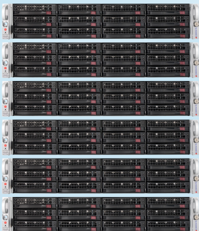
Cloud Nodes 6x SYS-6029U-TR4T